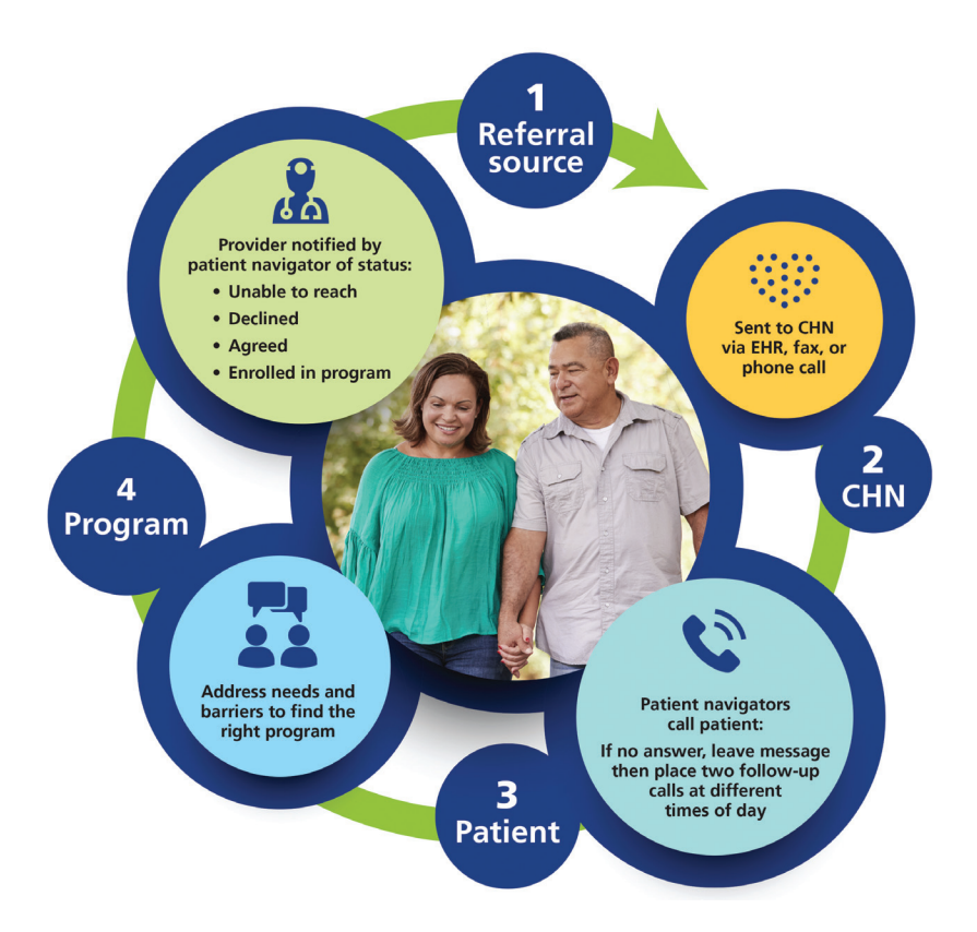
Illustration of Community Health Network Workflow