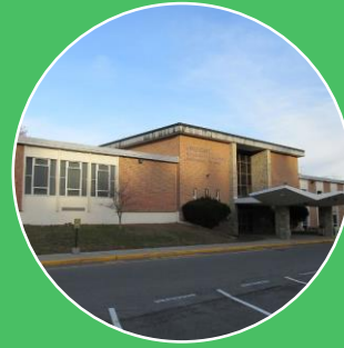
Vocational technical programs