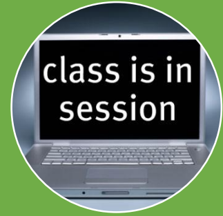
On-line training programs – National Pharmacy Technician Association